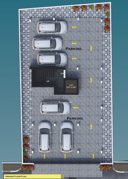
SITE / GROUND FLOOR PLAN