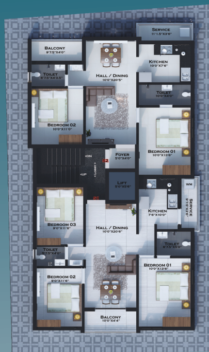
SECOND & THIRD FLOOR PLAN