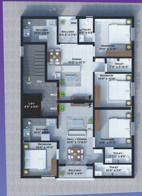
SECOND & THIRD FLOOR PLAN