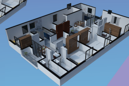
SECOND & THIRD FLOOR PLAN