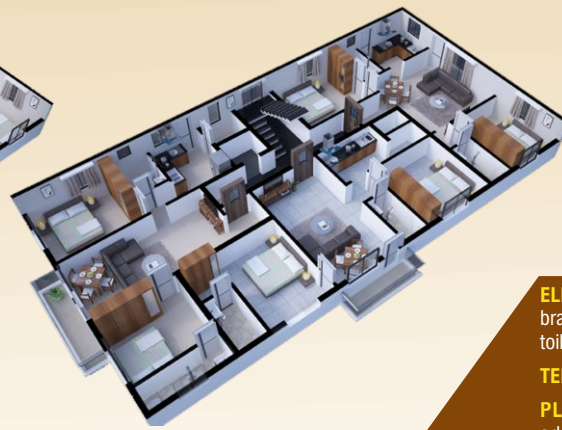
SECOND & THIRD FLOOR PLAN